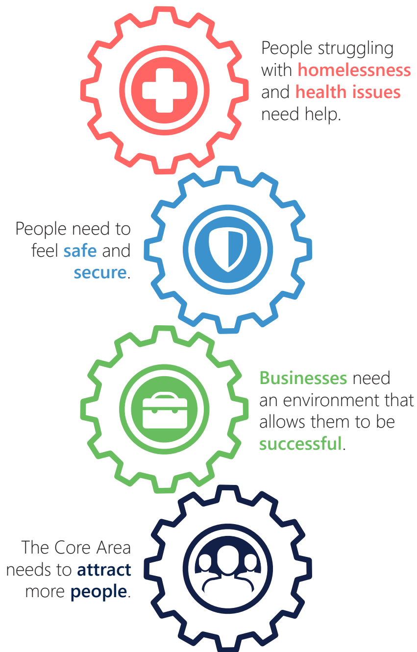
Figure 2: Core Areas Needs