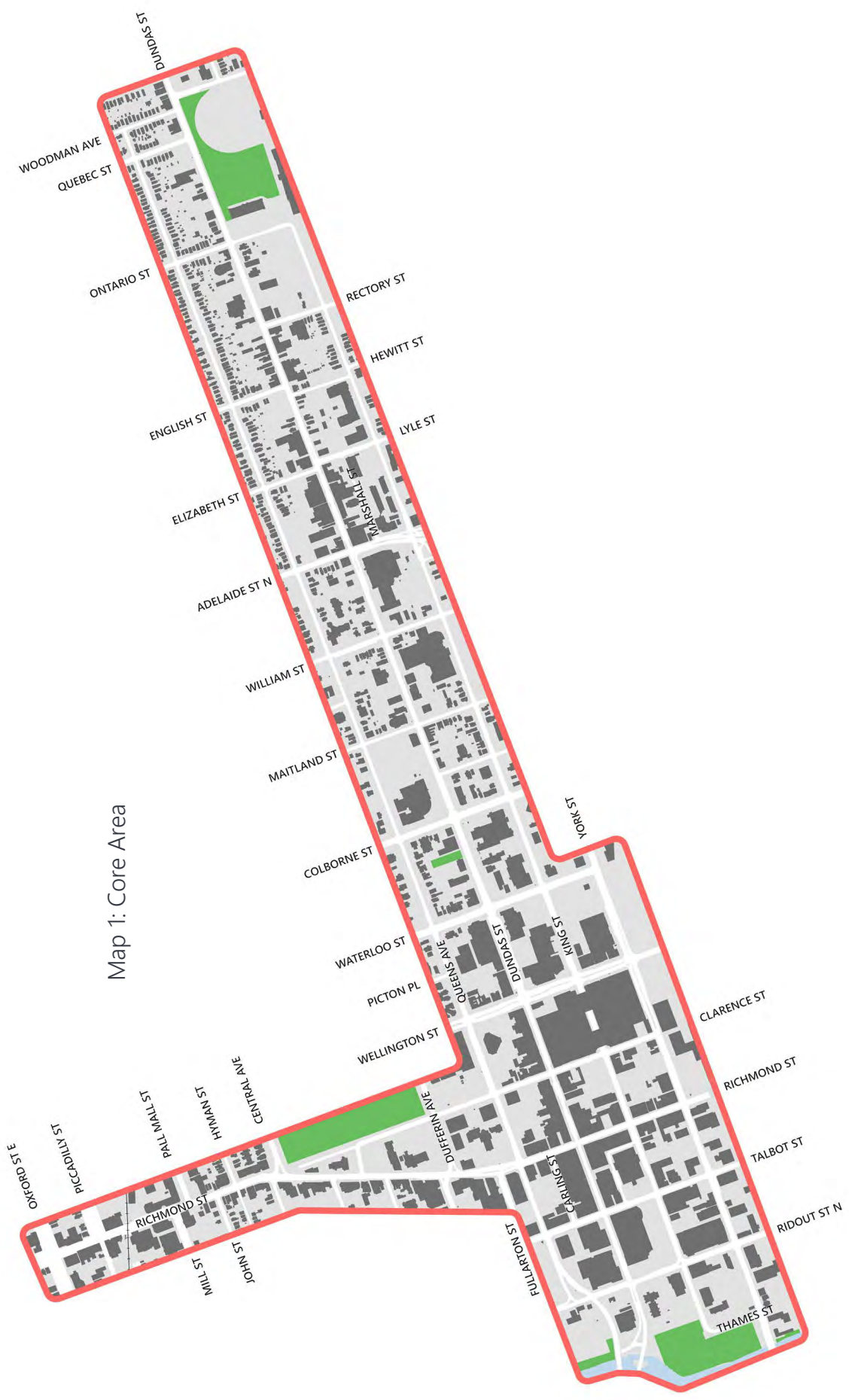
Map 1: Core Area